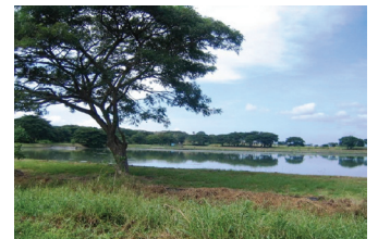
Above: Waste stabilization ponds as shown above near Waigani, provide a useful method of waste-water treatment and disposal for growing communities where funds and trained personnel are in short supply.