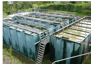
Above: Complex sewerage treatment plants like the one shown above often fail due to lack of maintenance and skilled operating personnel - resulting in discharge of untreated effluent.

Appropriate and where possible, low maintenance systems and equipment are considered for design solutions. An increasing amount of our consulting work in Papua New Guinea has been to assess and to redesign water and sewer schemes that incorporate complex and high maintenance technology. These complex design solutions often fail completely within a fraction of their intended operational life due to the inability or lack of resources to maintain the systems. Below are some pictures to better illustrate this situation.